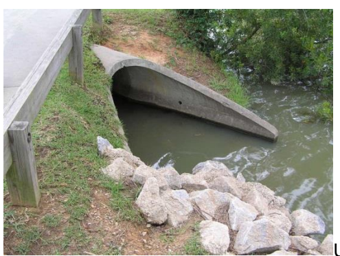
Use Pipe Flared End Section when specified in the