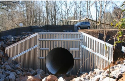
Use Pipe Wingwall